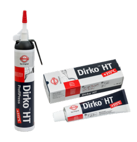
471.501 | 006.553